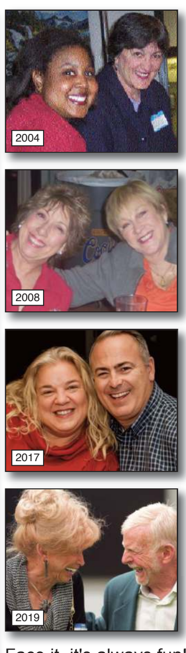
Face it, it's always fun! Holiday party pics: 19 years