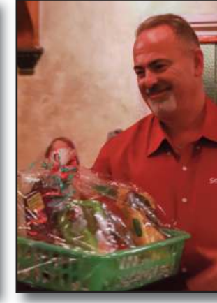
Cool Yule 2022, but a taste. Here's the whole stack.