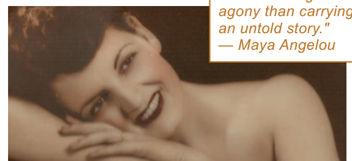
UNSUNG: REMEMBERING JEWELL HOUSE

All about the community of model railroading and rail enthusiasm in the Midwest and Southwest