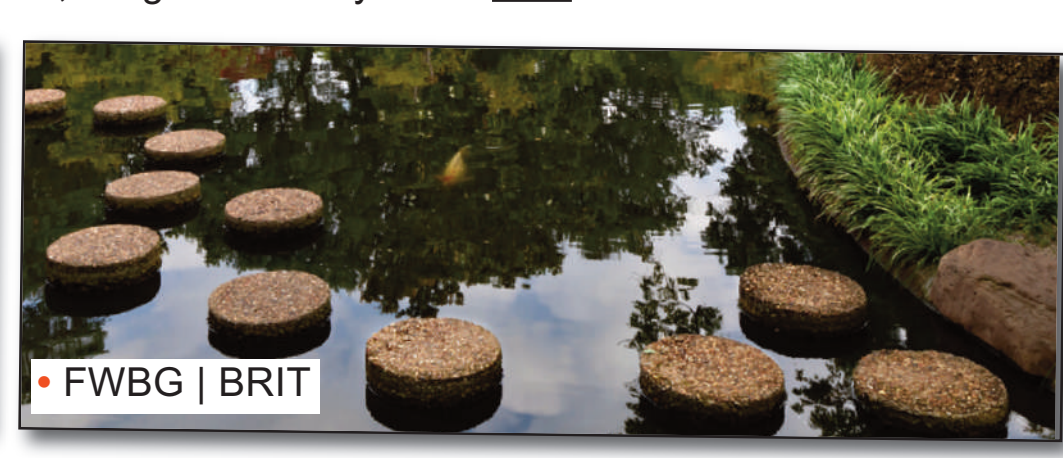
• FWBG | BRIT

GET A JOB. Listings in journalismjobs.com may add to this report. ... The Trinity Metro marketing department seeks a transit design coordinator. Info .